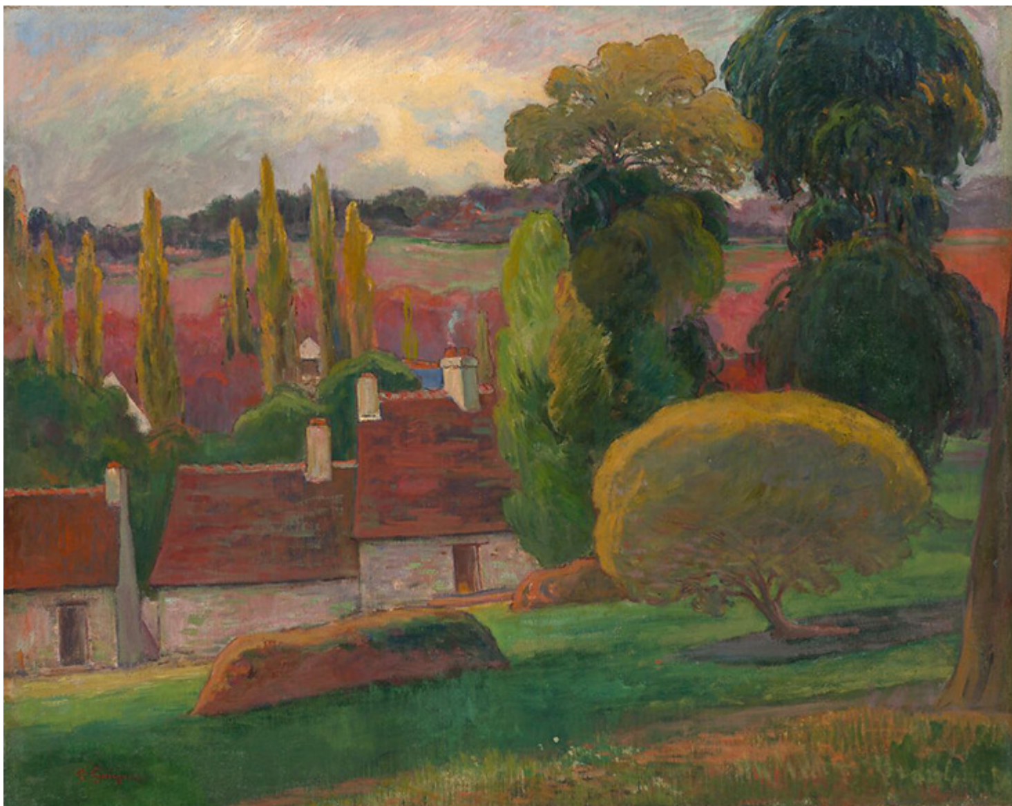
A Farm in Brittany, 1894

From dusty mountaintops to well-trodden tracks beaten dry by the sun, soft shades of pink like DESERT SAND crop up time and again in Post-Impressionist Paul Gauguin's art. He coupled this warm, hazy shade with lush, tropical greens and blues, conveying far flung, idealised and paradisiacal escapes from the grey smoky haze of the increasingly industrialised Paris where he spent his early adult years. In his hands, this soft pink became the vibrating colour of the earth, a fertile and foundational, life-sustaining substance from where all plants and trees emerge.