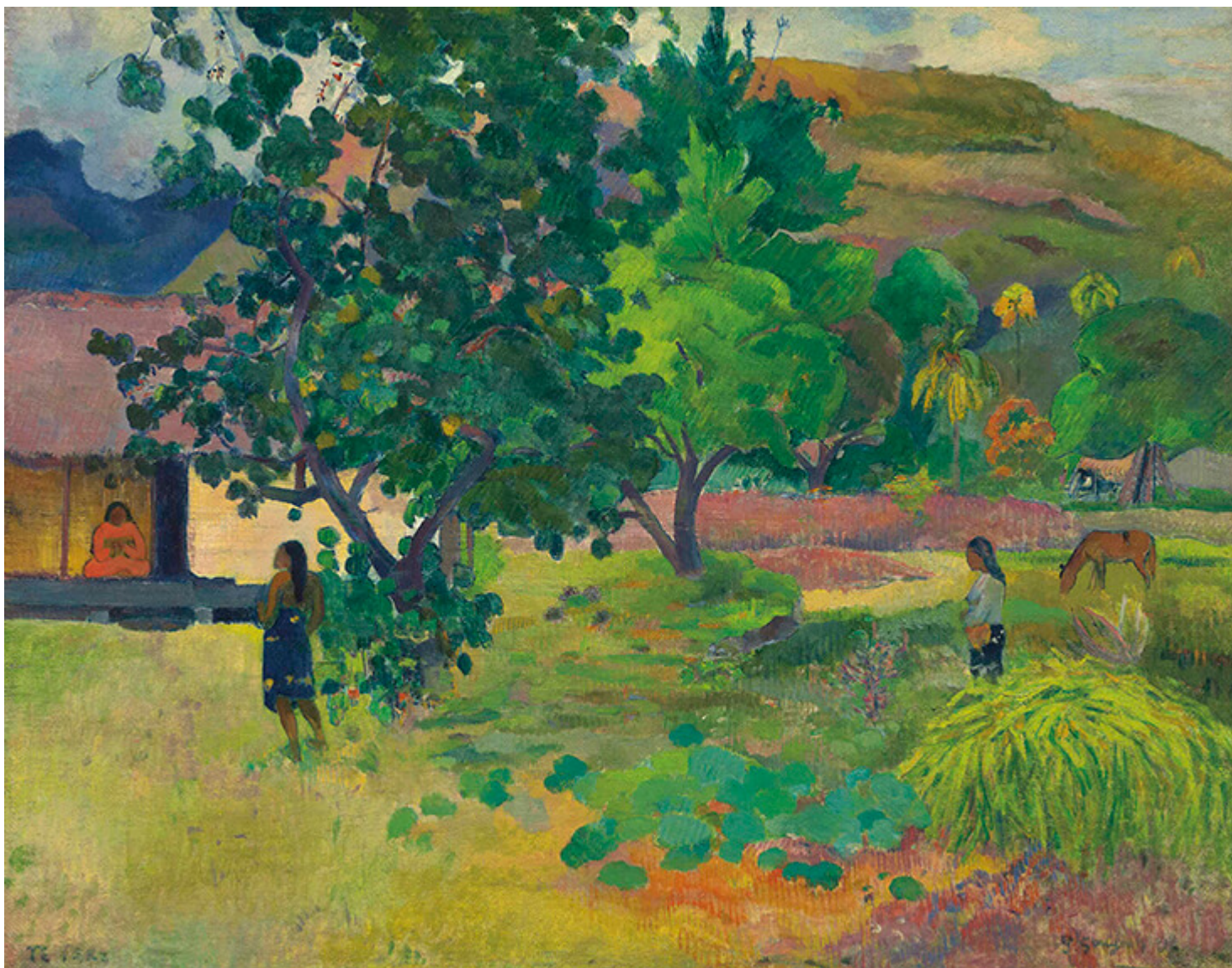
Te Fare (Le Maison), 1892

His desire for an escape from city life became greater than ever in the following years, as Gauguin spoke of his desire to leave behind “everything that is artificial and conventional.” In 1891, Gauguin departed for French Polynesia; it was a life-changing decision from which he would never look back. The paintings Gauguin made during his mature years in Tahiti are now the most celebrated of his entire career, demonstrating his endlessly inventive explorations into the atmospheric and symbolist possibilities of colour.