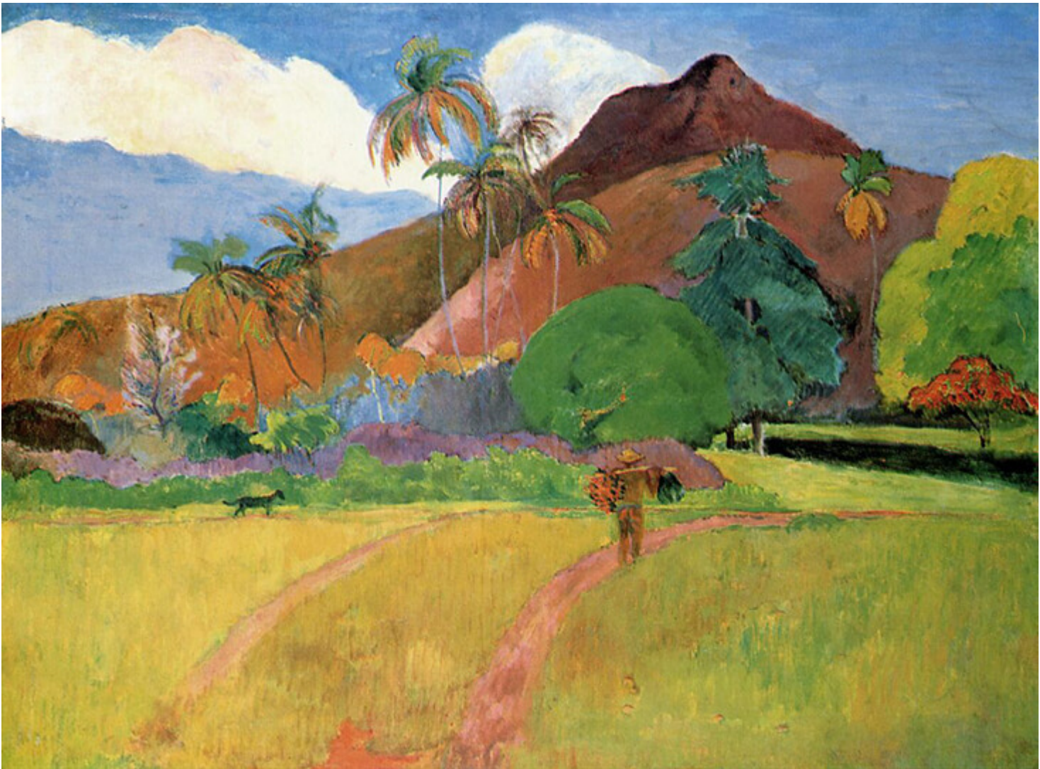
Tahitian Mountains, 1893

emphasise the glowing tropicality of the Polynesian scene. A dry track is salmon pink, leading us towards blooming apple and lime green plant life beyond. In the distance, stacked mountains are pale pinks and deep purples, capturing the magical, faraway wonder Gauguin experienced here. Te Fare (Le Maison) , 1892, is more abstract, reducing this tranquil rural scene into a wash of iridescent green and yellow light, tempered by patches of soft rose pink in the surrounding grounds and roofs.